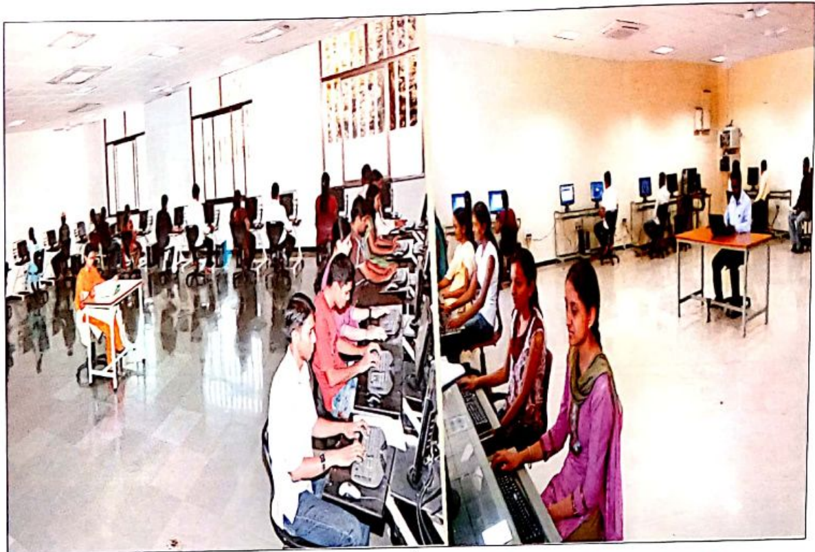
Computer Laboratory 1