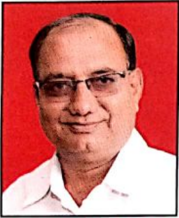
Hon. Shri. Nanaji Namdev Dalvi UpSabhapati