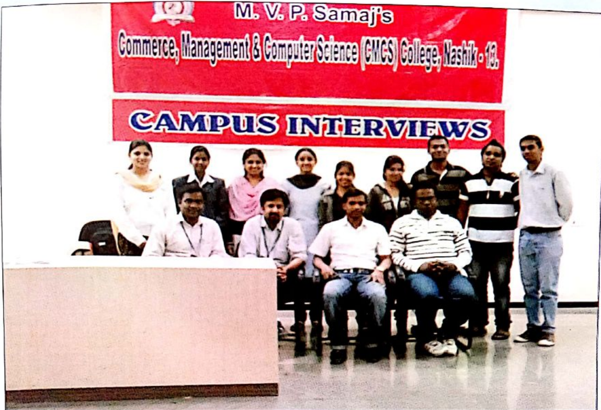
Visit of Wipro Company from First Campus Interviews (November 2011)