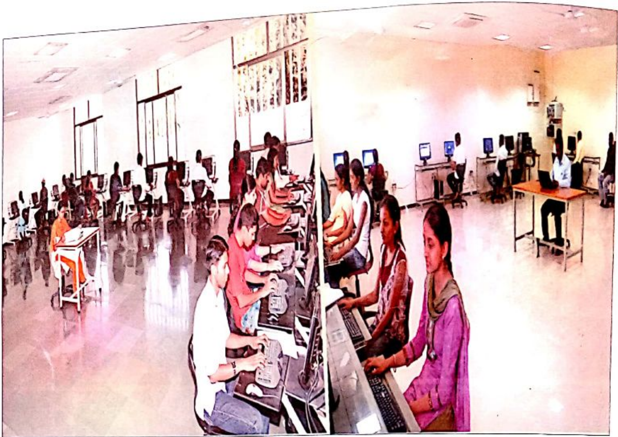
Computer Laboratory 1