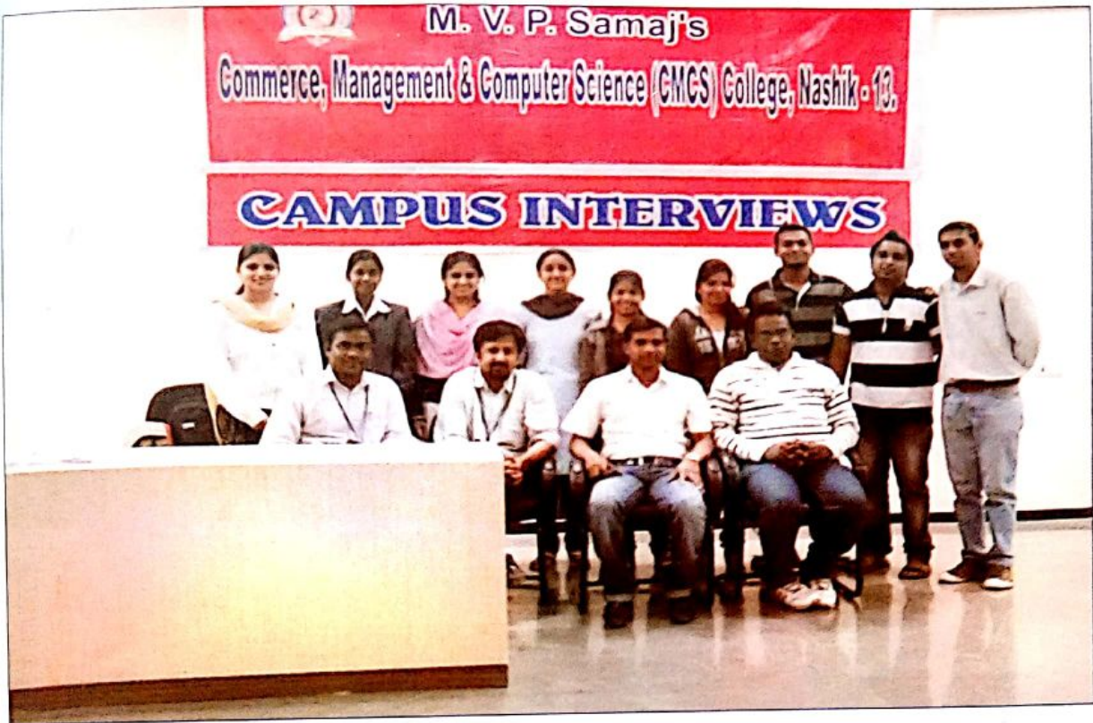
Visit of Wipro Company for First Campus Interviews (November 2011)